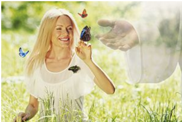
Jesus' power changes a repulsive sinner into a loving saint.

Answer: The only thing you can do is to accept salvation as a gift. Our works of obedience will not help us to be justified because we have already sinned and deserve death. But all who ask in faith for salvation will receive it. The worst sinner is accepted just as completely as the one who sins the least. Your past does not count against you! Remember, God loves everyone alike and forgiveness is simply for the asking. “By grace you have been saved through faith, and that not of yourselves; it is the gift of God, not of works, lest anyone should boast” (Ephesians 2:8, 9).